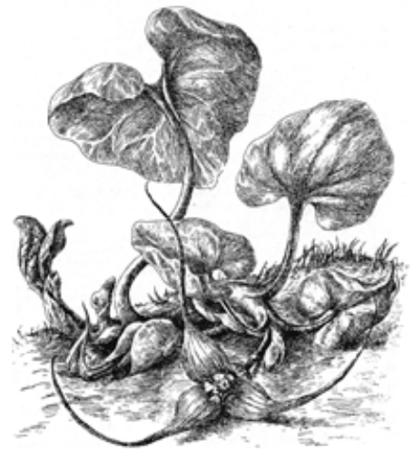
WILD GINGER-- Asarum caudatum .

Closer to the creek the wild ginger ( Asarum caudatum ) is thriving (See picture). Wild ginger is distinguished by its beautiful dark green long stemmed leaves and its unique raisin colored flowers that appear later in the Spring. Other plants to look for on the hill are small buckeye trees ( Aesculus californica ), California honeysuckle ( Lonicera hispidula ), elderberry ( Sambucus mexicana ) and false Solomon's seal ( Smilacina stellata ) and osoberry ( Oemleria cerasiformis ). Osoberry puts forth clusters of small oblong leaves from buds all along its slender twigs. In the middle of these hang short clusters of greenish white flowers. Miner's lettuce ( Montia perfoliata ) with its white bell like flowers rising from the middle of round leaves is another volunteer that is doing well. It is so-called because it became an edible staple for early settlers.