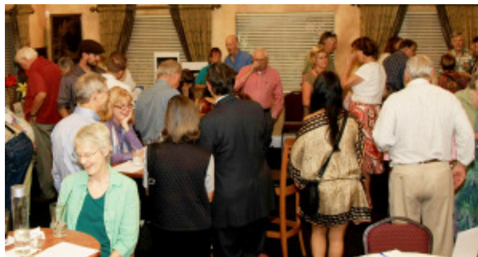
Good time had by all at Bistro Event

Directors are all volunteer and there are no paid employees.