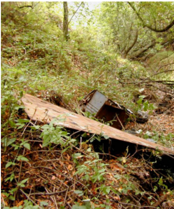
Butters Canyon Then (10 years ago)...